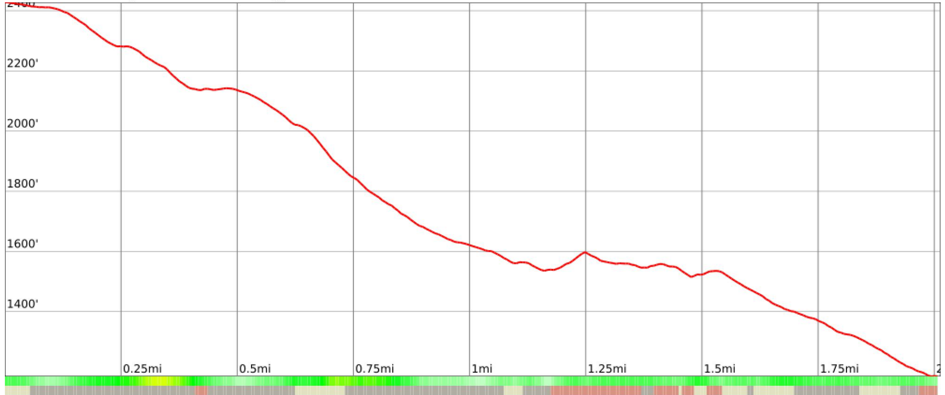
Slope Angle (top), Land Cover (middle), Tree Cover (bottom)

range 1181' to 2428' gain 118' loss 1358' exaggeration 3.4x